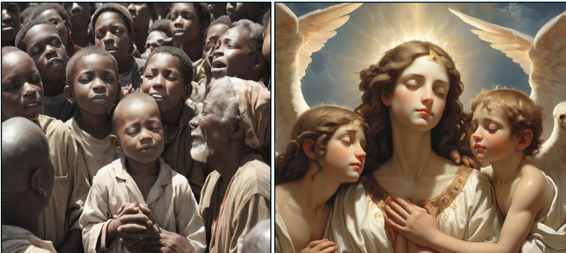
Images generated by GenCraft based on the prompt “God loving human beings”.

Matthew 18:1-3 states, "Truly, I say to you, unless you turn and become like children, you will never enter the kingdom of heaven". One could interpret the pictures as representing the start of the journey home to the Celestial Kingdom with the humility and innocence of children desiring God’s Love, and the culmination of one’s prayerful efforts to being transformed into an angel living in the Celestial Kingdom. I love the fact that AI chose to represent God’s Love for humanity with children. It is a reminder to view the world through the eyes of children and not look upon others, or ourselves, with judgement, but with understanding, compassion, and love.